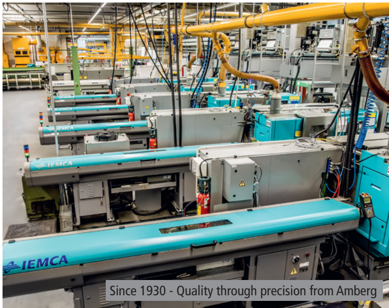
Since 1930 - Quality through precision from Amberg